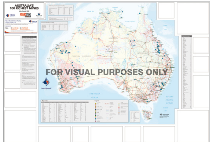
Map Size: 690mm(h) x 1000mm(w)

E: advertising.resourcestocks@aspermont.com