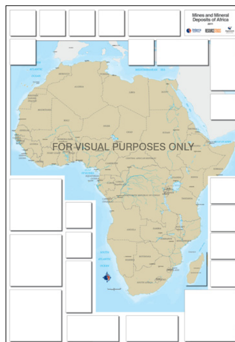
Map Size: 1000mm high x 690mm width

The full color map displays underground mines by owner and commodity, together with major infrastructure developments such as roads, rail lines, ports and oil and gas pipelines.